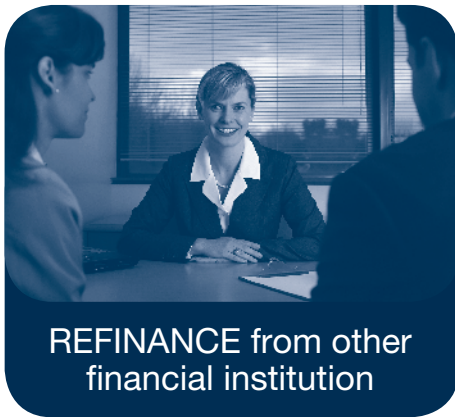
REFINANCE from other financial institution