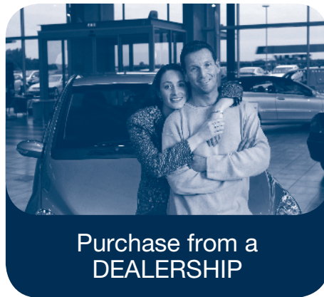
Purchase from a DEALERSHIP